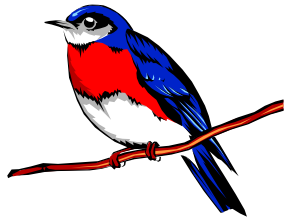
Is This Bluebird Appropriate for the License Plate